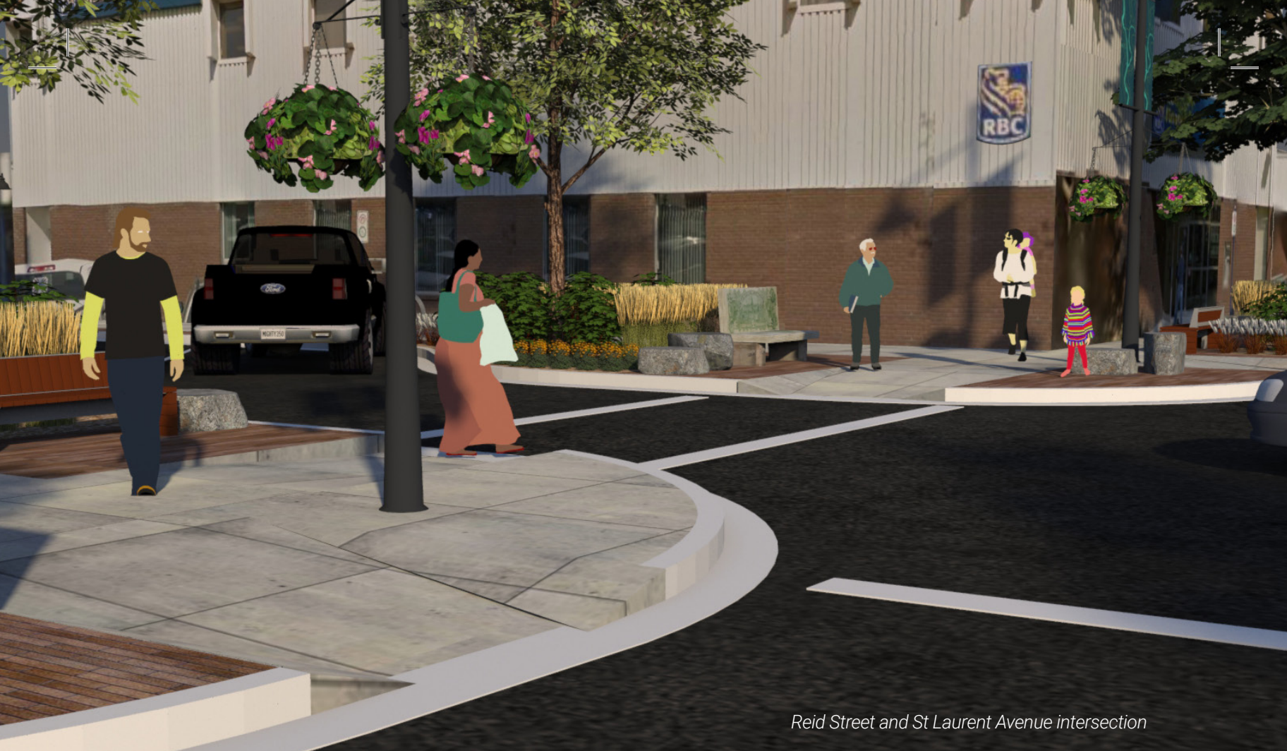
Reid Street and St Laurent Avenue intersection