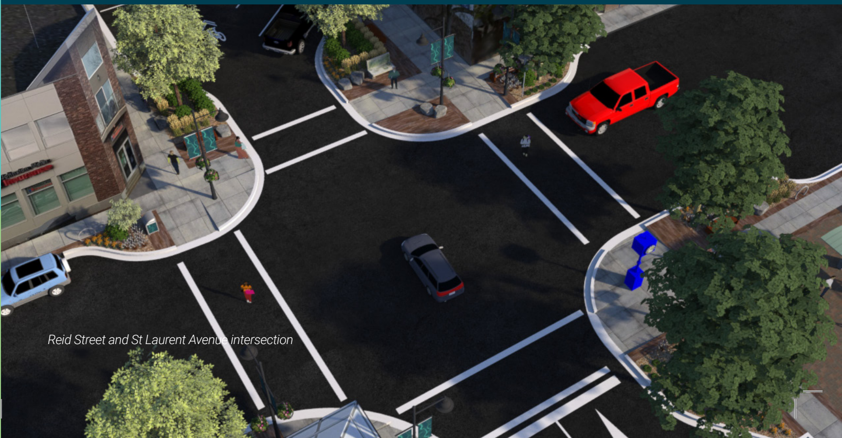
Reid Street and St Laurent Avenue intersection