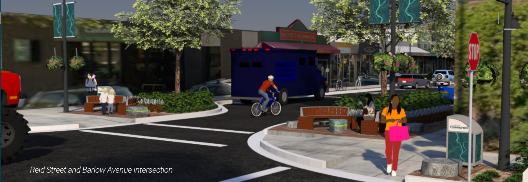
Reid Street and Barlow Avenue intersection