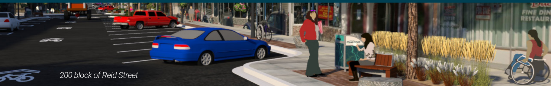
200 block of Reid Street

The Reid Street project has been broken up into two phases to help lessen the inconveniences of the construction period. The project is expected to be complete in September.