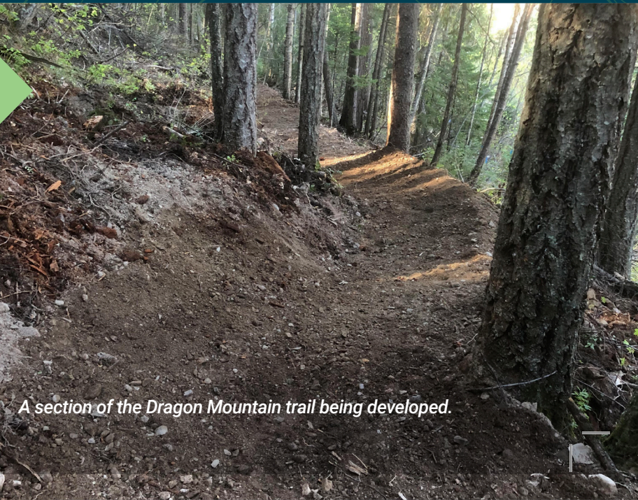
A section of the Dragon Mountain trail being developed.

The City and CRD recognize the value of trails for both residents and visitors. We have partnered with Gold Rush Cycling Club and the Cariboo Mountain Bike Consortium to build a 9 km mountain bike climb in Dragon Mountain Provincial Park. This project is in addition to the four new trails being constructed in the Wonderland Trail Network located off of Quesnel-Hydraulic Rd. Find more information at www.quesnel.ca/master-trail-plan .