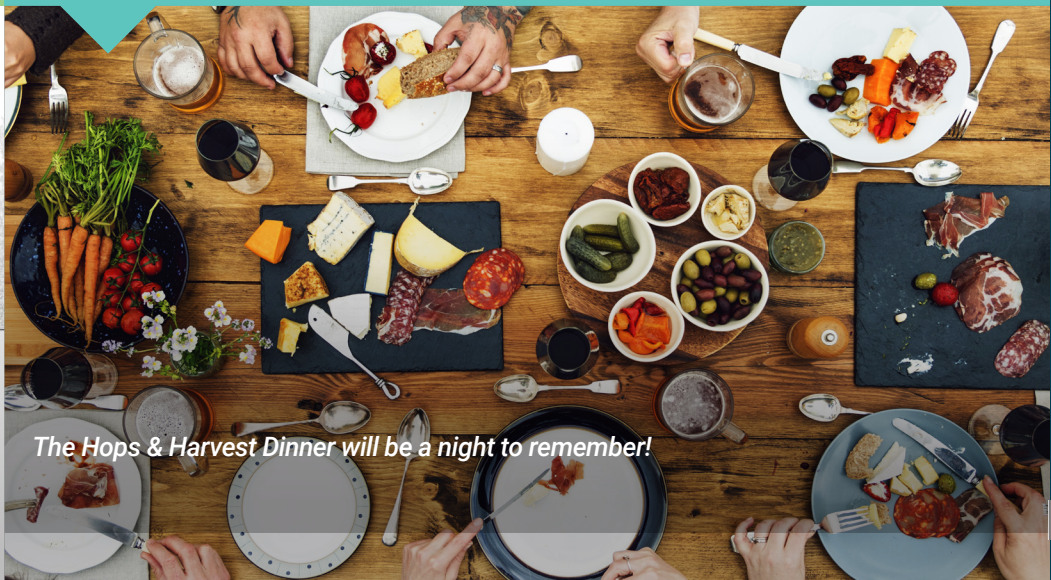
The Hops & Harvest Dinner will be a night to remember!