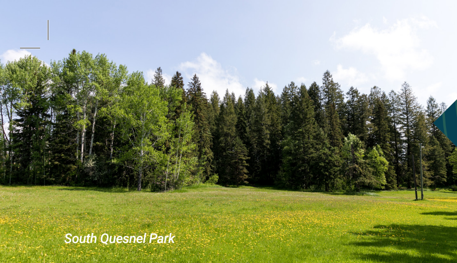
South Quesnel Park