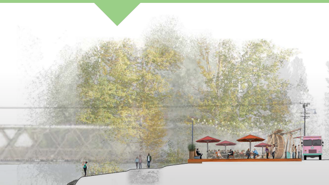
Heritage Corner concept drawing