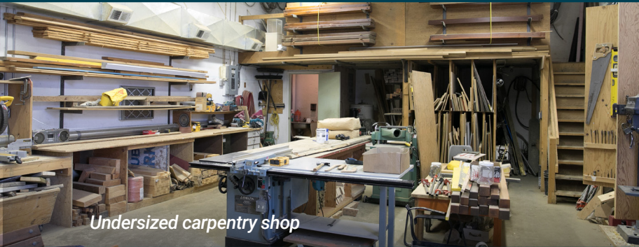
Undersized carpentry shop