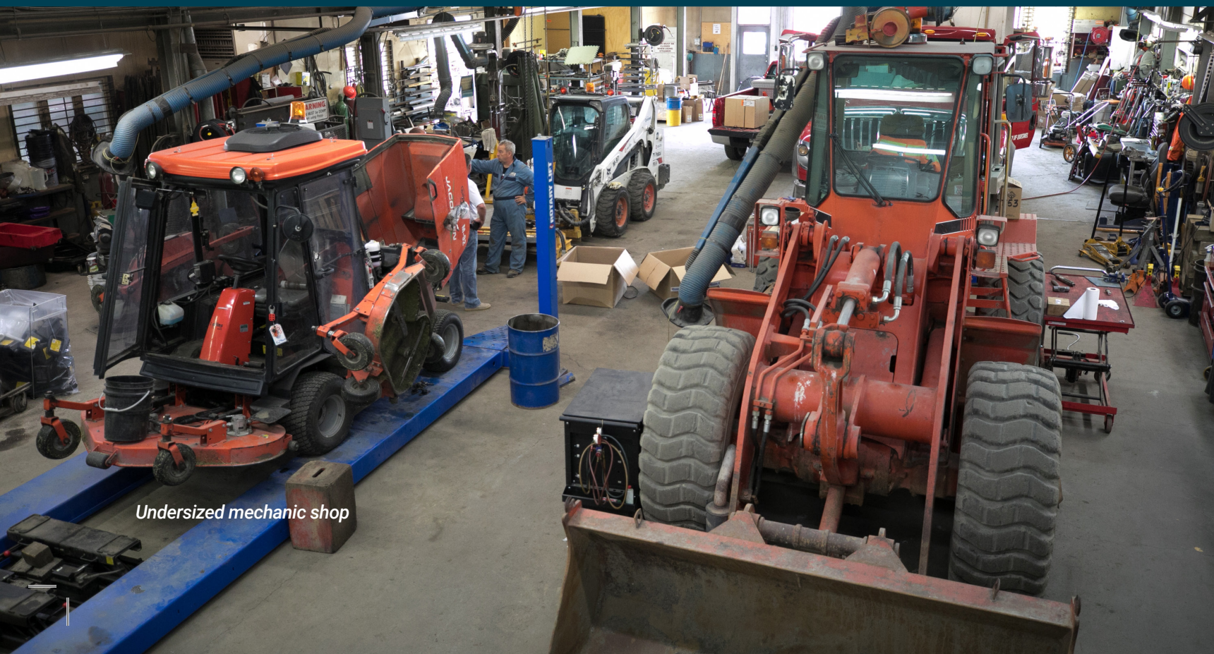
Undersized mechanic shop

View the full report at www.quesnel.ca/referendum .