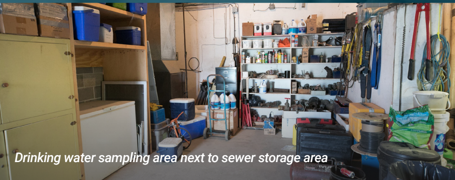
Drinking water sampling area next to sewer storage area