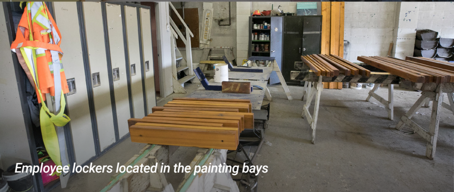
Employee lockers located in the painting bays

Find more information at www.quesnel.ca/referendum