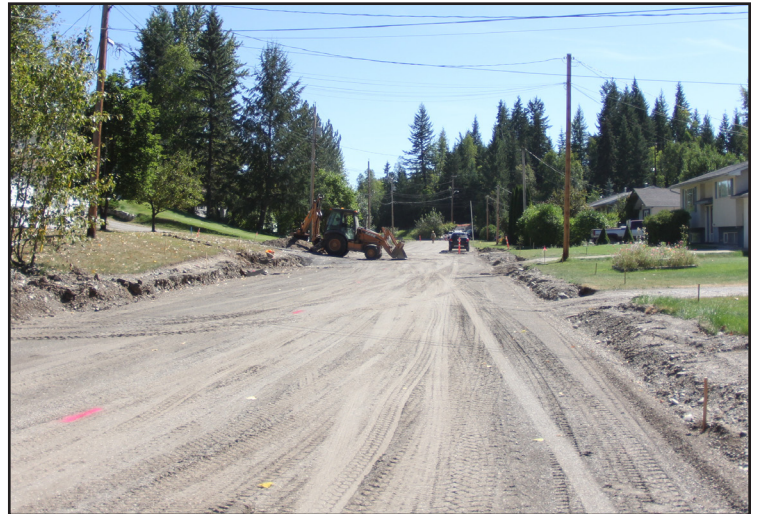
Photos: (L) Construction crews excavate Anderson Dr. (R) Healy St being prepped for paving.