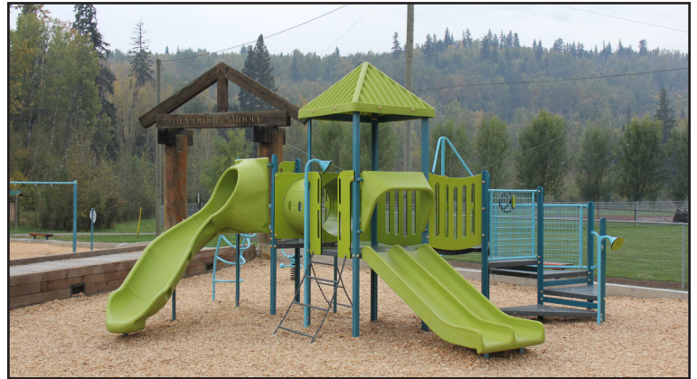
Photos: The new West Fraser Timber Park playground was installed August 2016.