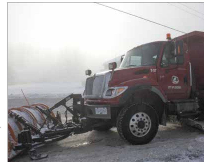
City Crews at Work

The Ministry of Transportation has a multi-million dollar paving contract that will start at the beginning of spring. Sections of Highway 97 will be paved, including the North Star