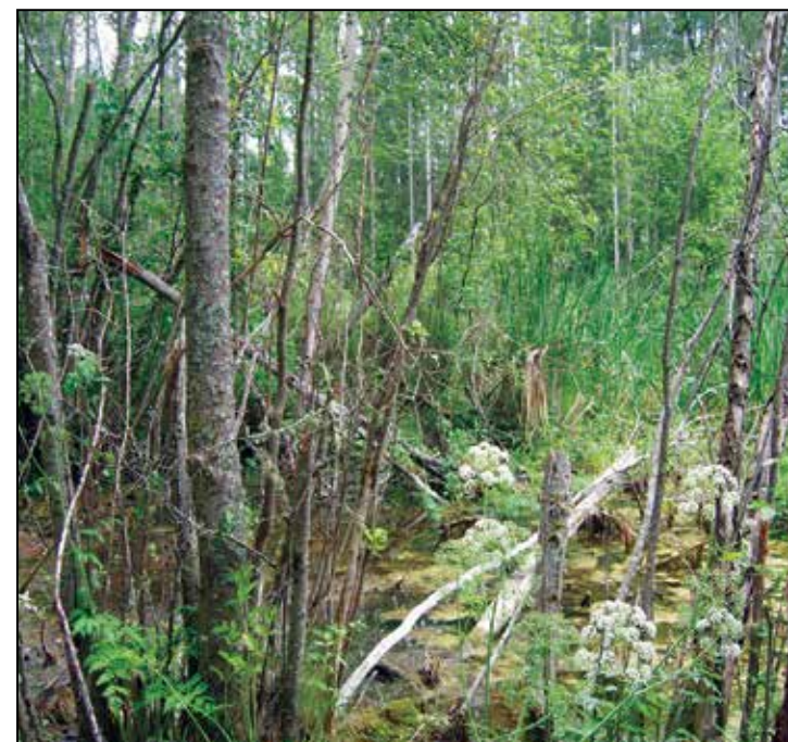
Lewis Drive Pond

Do your part by locking your doors, securing your valuables and reporting any suspicious or criminal activity to police.