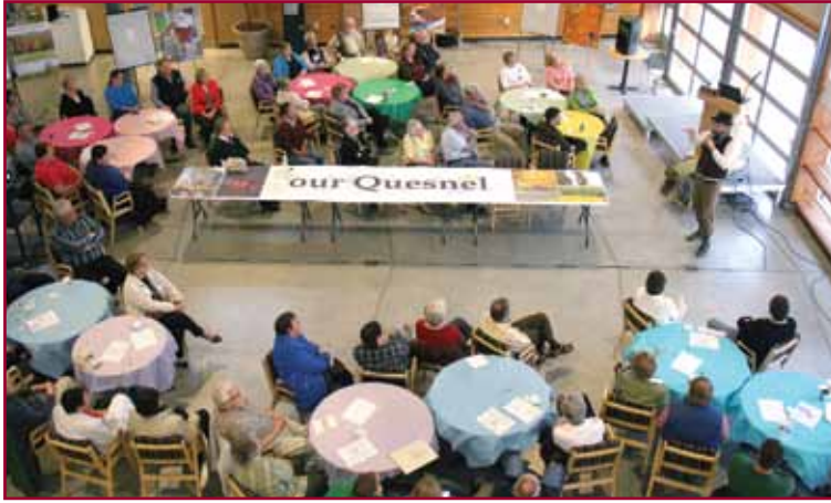
The community took part in several workshops in April to envision Quesnel's future 40 years from now.