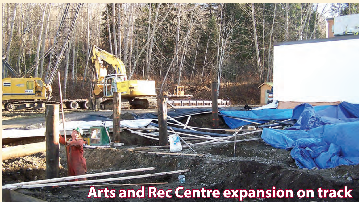
Arts and Rec Centre expansion on track

Crews work on the foundation for the expansion of the weight room at the Arts and Recreation Centre. The work is due to be complete before March 31, 2010.