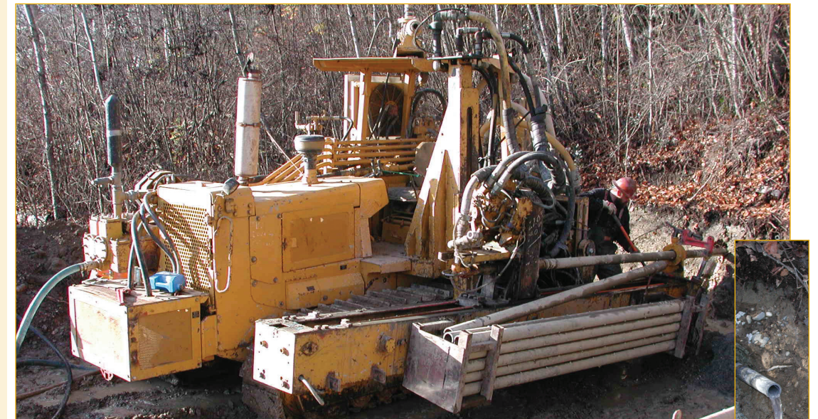
A specialized horizontal drilling machine was brought in to help install the horizontal drains as part of the West Quesnel Land Stability Program's trial dewatering program

The Environmental Advisory Committee will host another E-Waste Electronic Recycling Day on Saturday May 3 at the Sani-Dump loop - watch for details in the coming months.