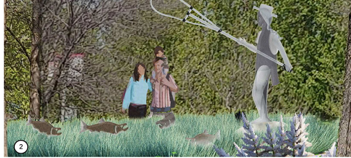
Concept designs, Lhtako Dene Park