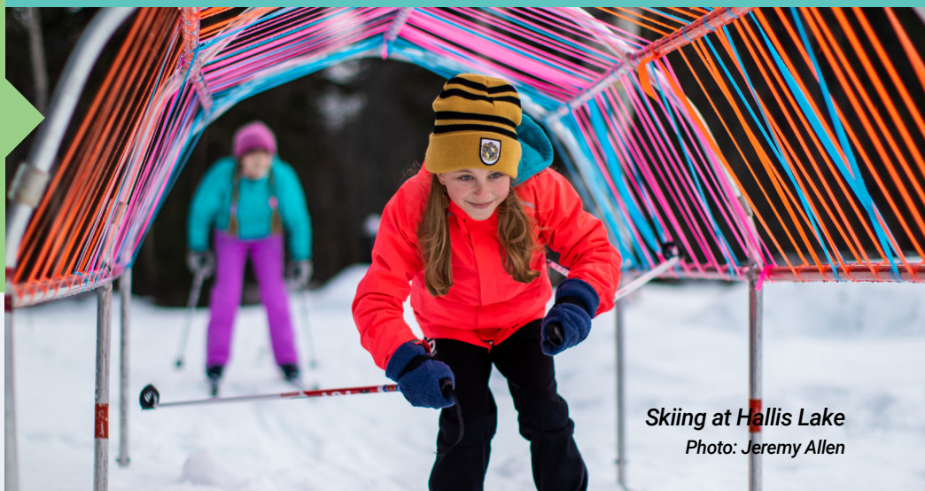
Skiing at Hallis Lake