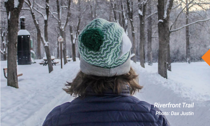
Riverfront Trail