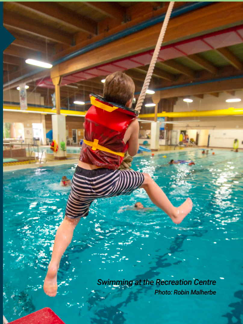
Swimming at the Recreation Centre

Learn more: quesnel.ca/west-fraser-centre