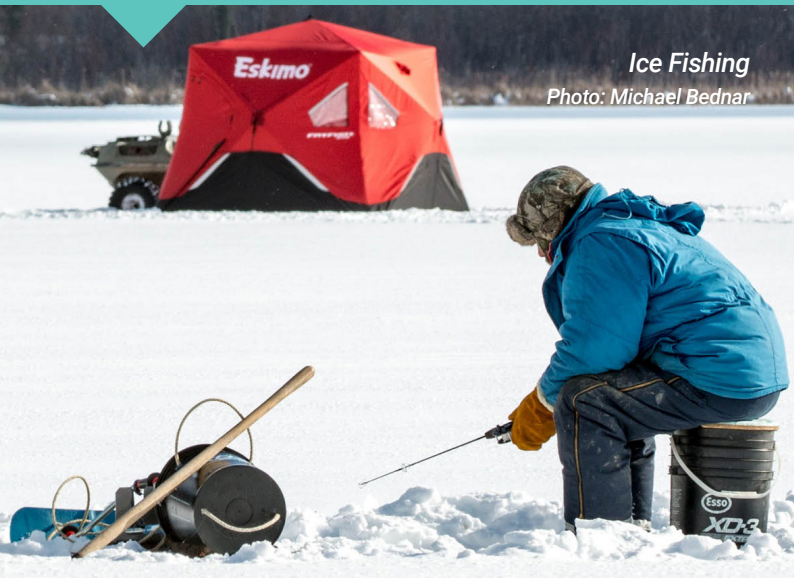
Ice Fishing

If venturing onto open ice, please take notice of weather patterns and take safety precautions as ice thickness can change quickly. More information: tourismquesnel.com/stay/ten-mile-lake-provincial-park/